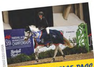
GOLDEN BACKSTAGE PASS