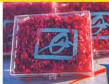
AWARDS & REWARDS